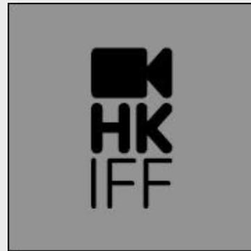
Colour logo for use on gray backgrounds