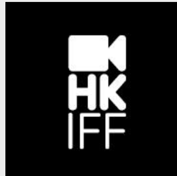
White version for use on dark backgrounds